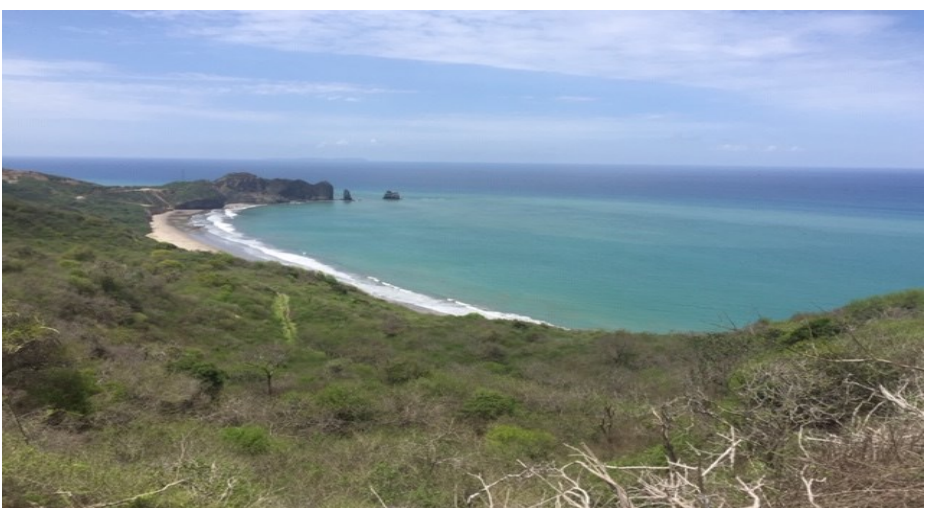
Liguiqui, Manta, Ecuador.

We hope you enjoy "Issue 1 of the "Dos Corrientes Journal."